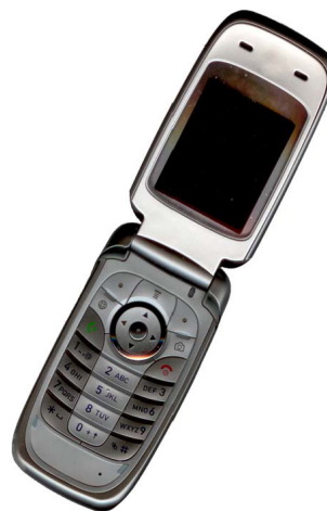
Fig. 3. Example of an image with acceptable resolution