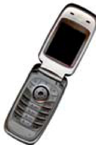
Fig. 2. Example of an unacceptable low-resolution image